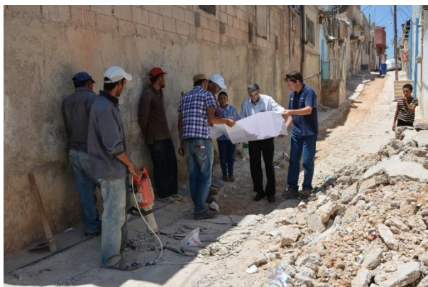
Jerash WATSAN project: Preparing for final reinstallation of the street